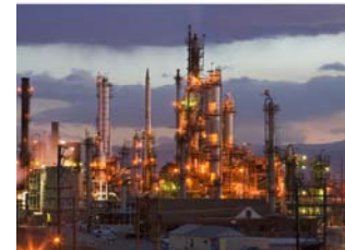
Manufacturing Noise & Vibration