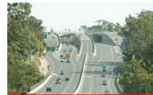
Transportation Noise & Vibration