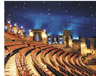
Architectural & Building Acoustics

Please send a CV and letter to Neil Gross at: neilg@wilkinsonmurray.com.au