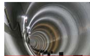
Construction Noise & Vibration