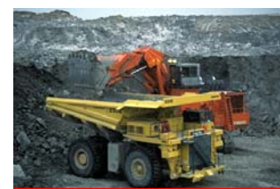
Resource Noise & Vibration