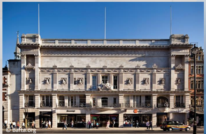
Bloomberg HQ, London