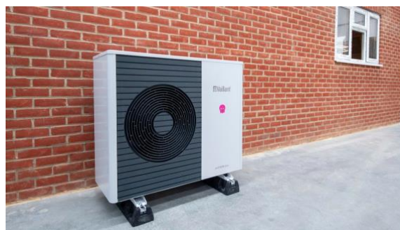
ASHP on anti-vibration mounts but near opening

If a heat pump is rigidly fixed to a building or to solid ground on or near foundations, vibration will transfer into the structure and may cause structure borne noise to be re-radiated inside. This can cause annoyance and a significant adverse impact to occupiers even if the associated sound level is relatively low. In noisy areas, where buildings are very well insulated against external noise, internal masking noise levels may be lower, allowing the re-radiated noise to be more noticeable. To minimise structure borne noise the type of mountings used for the HP are important and should ideally isolate the unit from the structure appropriately.